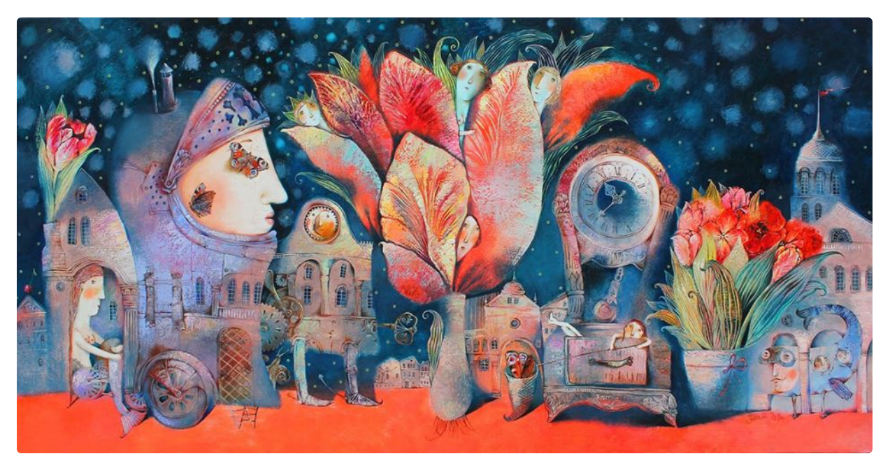
Anna Silivonchik, A Night in May , 2016, Oil on Canvas, 39 x 79 in/100 x 200 cm