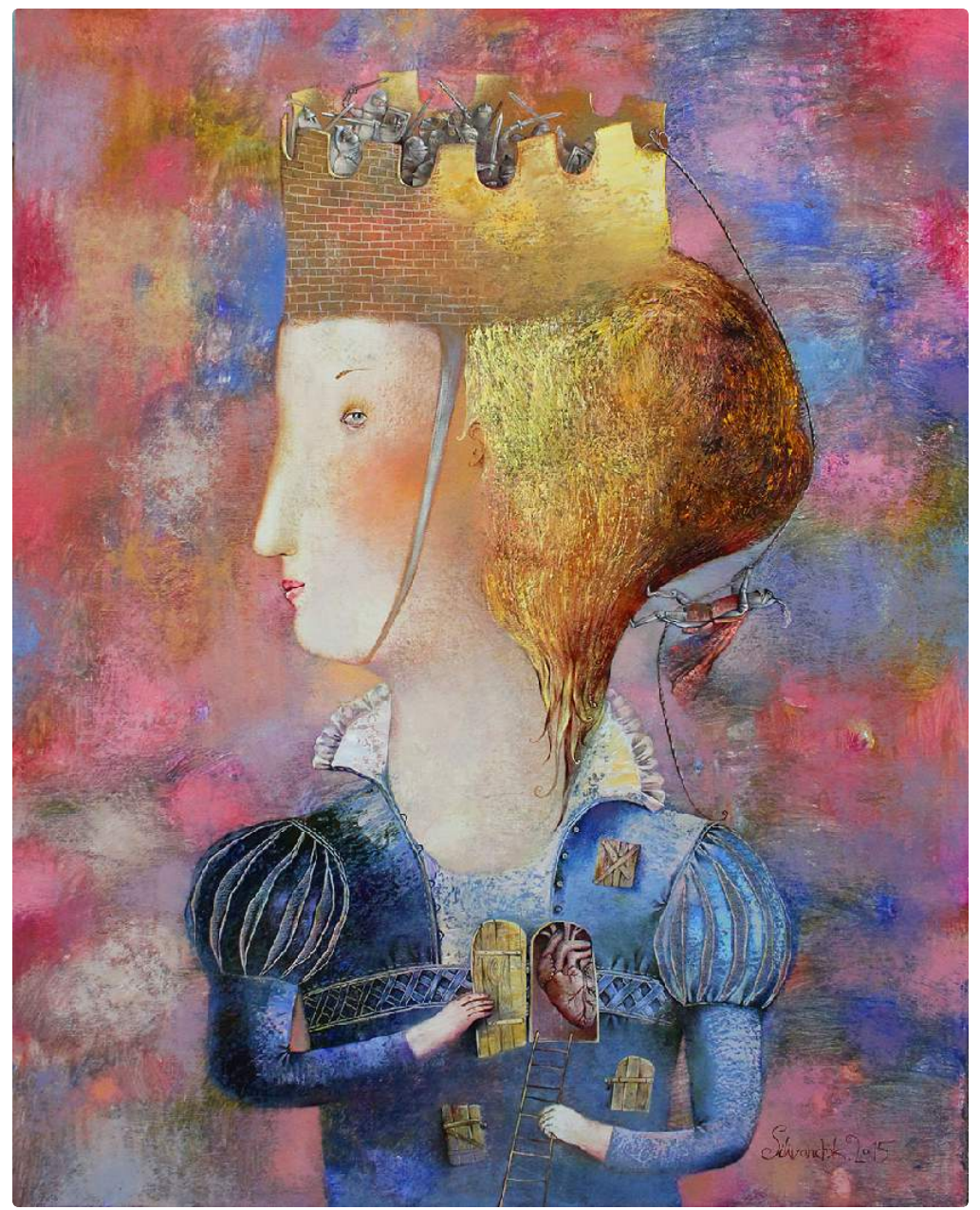
Anna Silivonchik, Knights of My Heart, 2015 Oil on Canvas 39 x 32 in (100 x 80 cm)