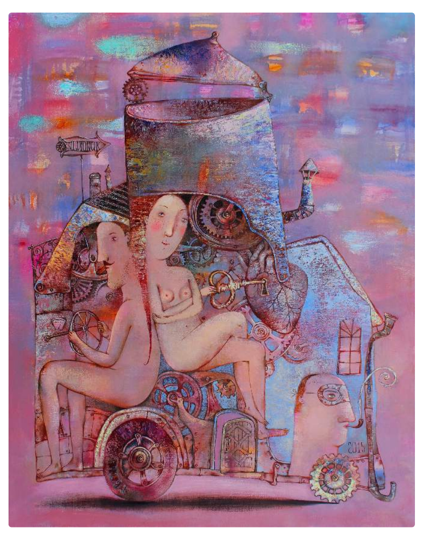
Anna Silivonchik, A Journey Inside , 2015 Oil on Canvas 39 x 36 in (100 x 90 cm)