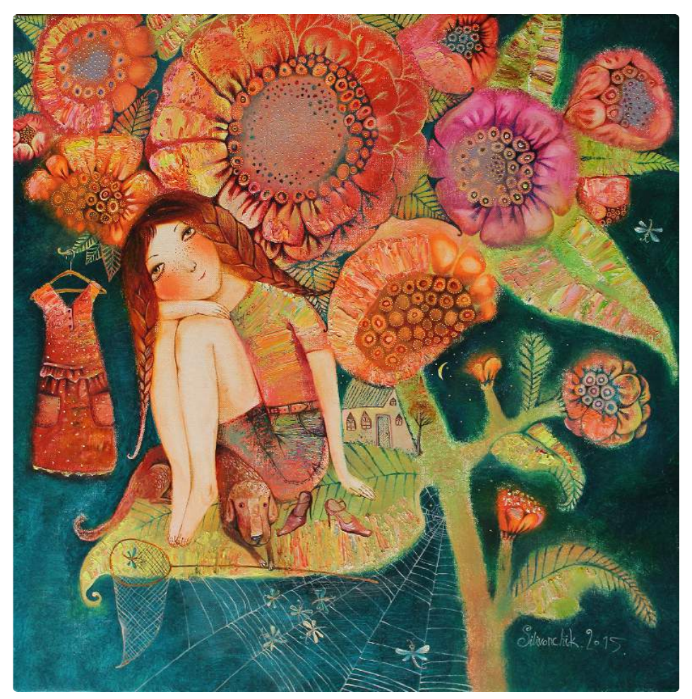
Anna Silivonchik, Summer in the Countryside , 2015 Oil on canvas 28 x 28 in (70 x 70 cm)