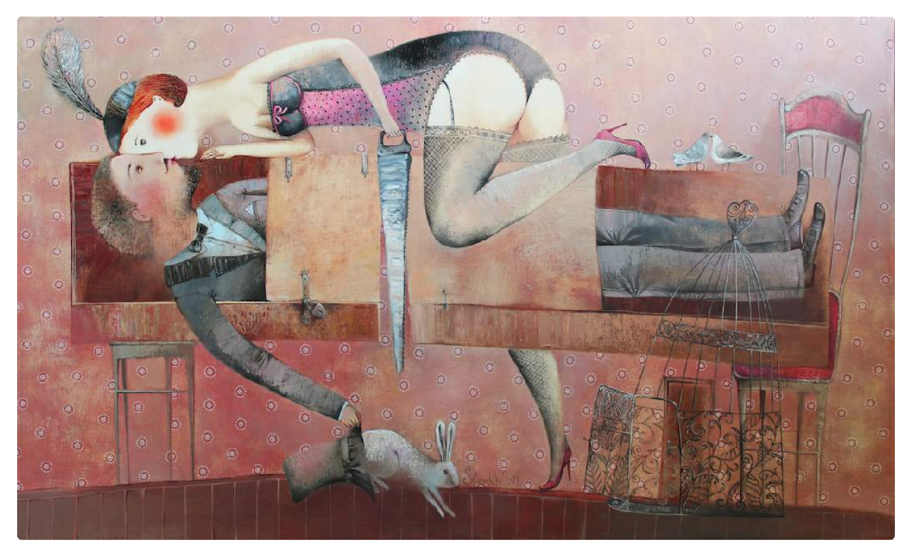
Anna Silivonchik, Illusion of Love, 2014 Oil on canvas 47 x 28 in (120 x 70 cm)